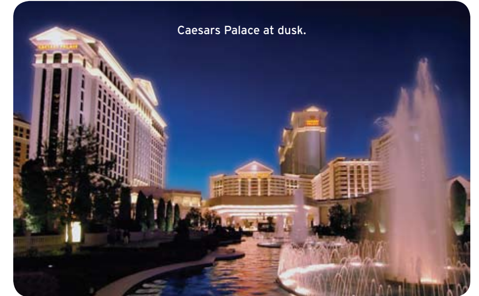
Caesars Palace at dusk.

The first thing to hit you as you gaze down the Strip are the lavish themed hotels, which give the street something of an amusement park ambience – from the Egypt-inspired Luxor to the Paris and the elegant Venetian – all of which feature scaled-down versions of