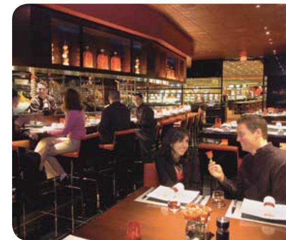
L'Atelier Restaurant at the MGM Grand.

Tip: If your feet give out on you, you can always ride back to your starting point in comfort on the Las Vegas Monorail, which runs for 6.4 kilometres (4 miles) from the MGM Grand to the Sahara Hotel, with seven convenient stops at major Strip hotels along the way. Hours of operation are 7 a.m. to 2 a.m. (3 a.m. on weekends). □