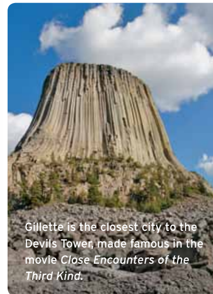
Gillette is the closest city to the Devils Tower, made famous in the movie Close Encounters of the Third Kind .